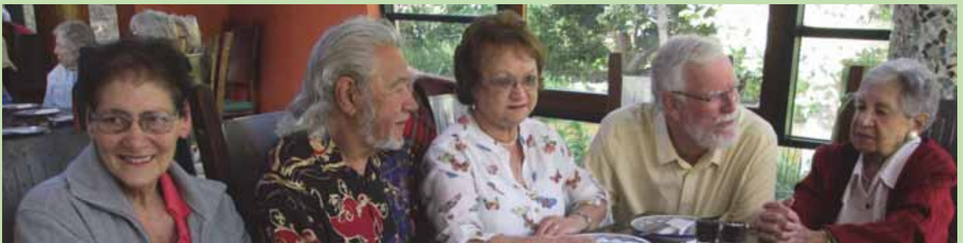
Friendship Group tea at Kirstenbosch on 8 October 2019.

He will be great and will be called the Son of the Most High. The Lord God will give him the throne of his father David, and he will reign over Jacob's descendants for ever; his kingdom will never end.' 'How will this be,' Mary asked the angel, 'since I am a virgin? The angel answered, 'The Holy Spirit will come on you, and the power of the Most High will overshadow you. So the holy one to be born will be called the Son of God (Luke 1:32-35).